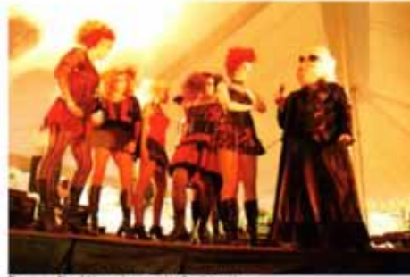
The ongoing line of this party has a straight talk with two girls onstage.

Her Royal Majesty Invites All Funlovers to Her Black & White Party By Greg King