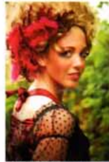
Ladies of remarkable beauty and posse appeal.